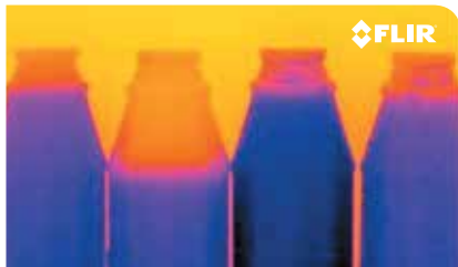
Detecting liquid level in visually opaque bottles.